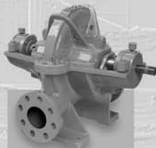
HORIZONTAL SPLIT CASING PUMP