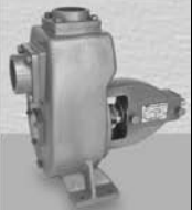
SELF PRIMING CENTRIFUGAL PUMP