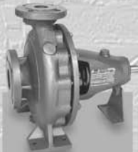
CENTRIFUGAL PUMP TYPE HC