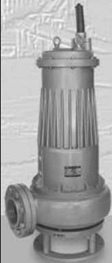
SUBMERSIBLE SEWAGE PUMP