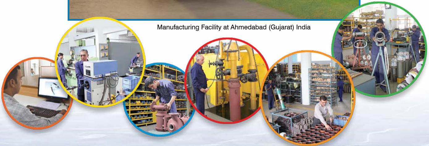
Manufacturing Facility at Ahmedabad (Gujarat) India